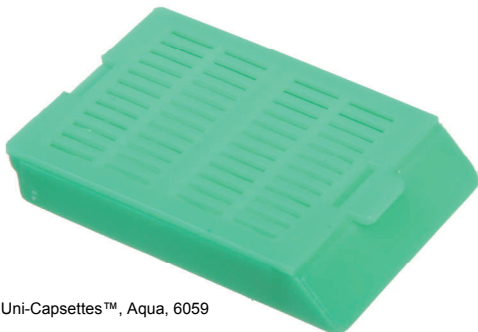
Uni-Capsettes™, Aqua, 6059