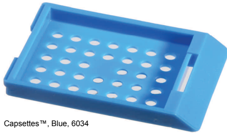
Capsettes™, Blue, 6034