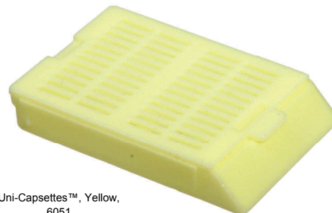
Uni-Capsettes™, Yellow, 6051