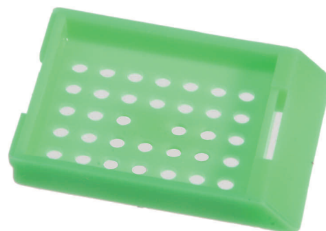
Capsettes™, Green 6033