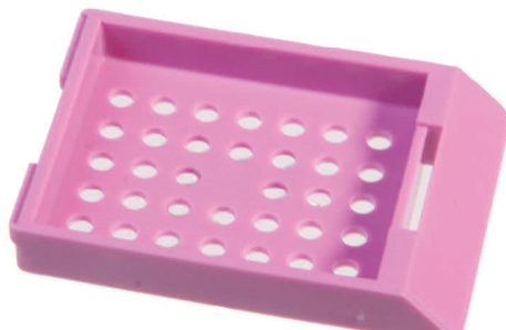
Capsettes™, Pink, 6032

Histo Plas™ Capsettes™ and Uni-Capsettes™ provide a modular, organized means for safe and consistent processing, embedding, sectioning and storage of specimen samples. Available in 16 colors which provide a convenient means of separating surgical and autopsy cases, institutions, pathologist, etc. Both the Histo Plas Capsettes and Uni-Capsettes are accepted by all of the current automatic cassette labelers.